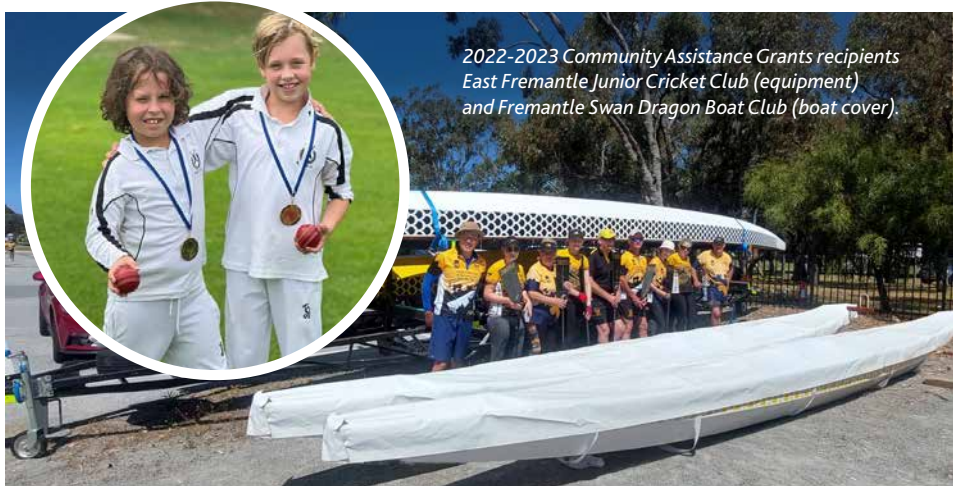
2022-2023 Community Assistance Grants recipients East Fremantle Junior Cricket Club (equipment) and Fremantle Swan Dragon Boat Club (boat cover).