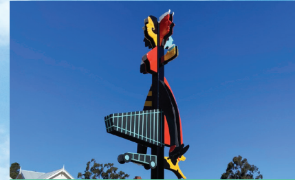
Public Art $45k