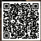
Register for e-Rates