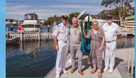
Community Sponsorship $147k