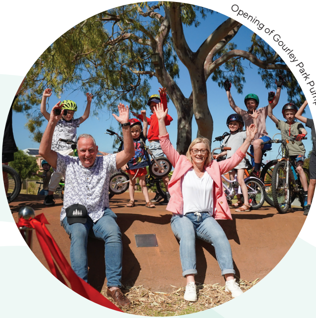
Opening of Courley Park Pump Track + Nature Play