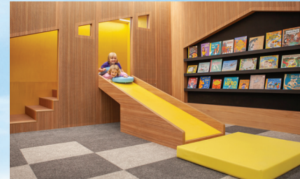
Library Services $156k (Fremantle Library)