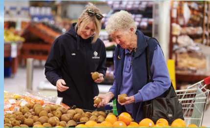
Neighbourhood Link $668k (Federal Funding)