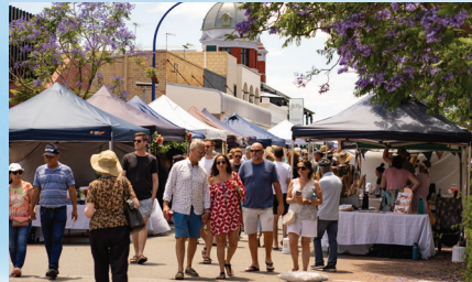
Community Events $192k