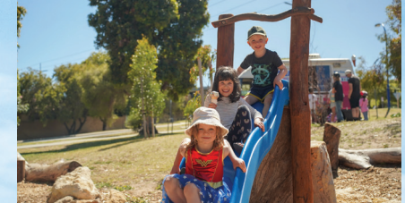
Parks and Ovals New Projects $207k Maintenance $1.4m

Roads, Footpaths, Drains and Car Parks Upgrades $465k Maintenance $2m