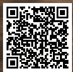
Subscribe to TownTalk

P (08) 9339 9339 E admin@eastfremantle.wa.gov.au 135 Canning Highway, East Fremantle PO Box 1097 Fremantle 6959 eastfremantle.wa.gov.au