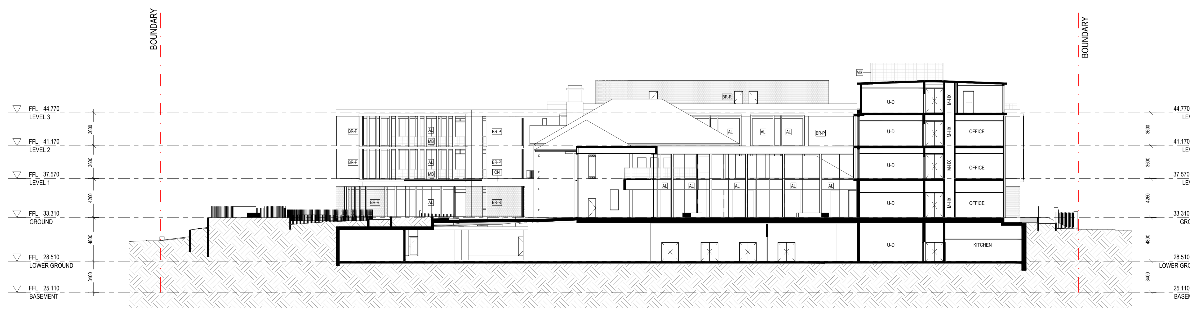
9 SECTIONAL ELEVATION - NORTH A 0050 1:200