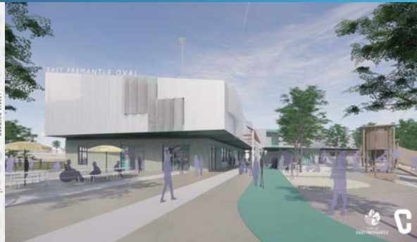
Concept Imagery – Northern Arrival