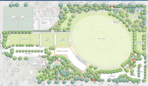
Concept Imagery – Landscape Design

CEO Gary Tuffin. The concept imagery of the landscape design includes a dog exercise area, skate and basketball zone and native play area, plus natural landscaping features the inclusion of many endemic trees providing shade, biodiversity and amenity. The second concept imagery shows the northern arrival with the "wayfinding" leading past the café on the left and playground on the right. All going to plan, construction is expected to commence in September.