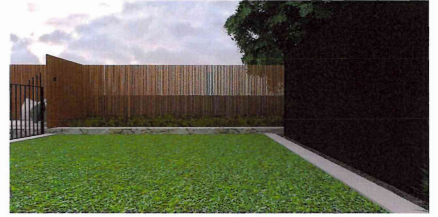
RENDER OF PROPOSED VIEW (WITH SCREEN)