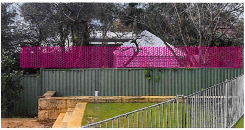
PROPOSED HEIGHT (+1200mm)

Approved subject to minor adjustments 2/8/2024