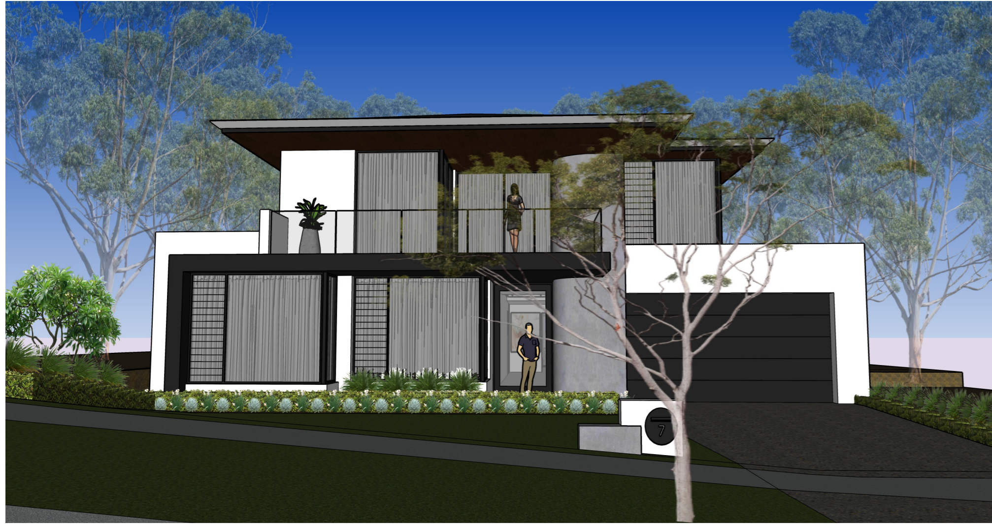
3D Perspective Not to scale