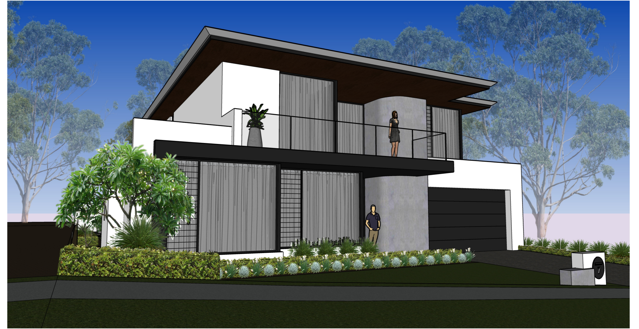
3D Perspective Not to scale