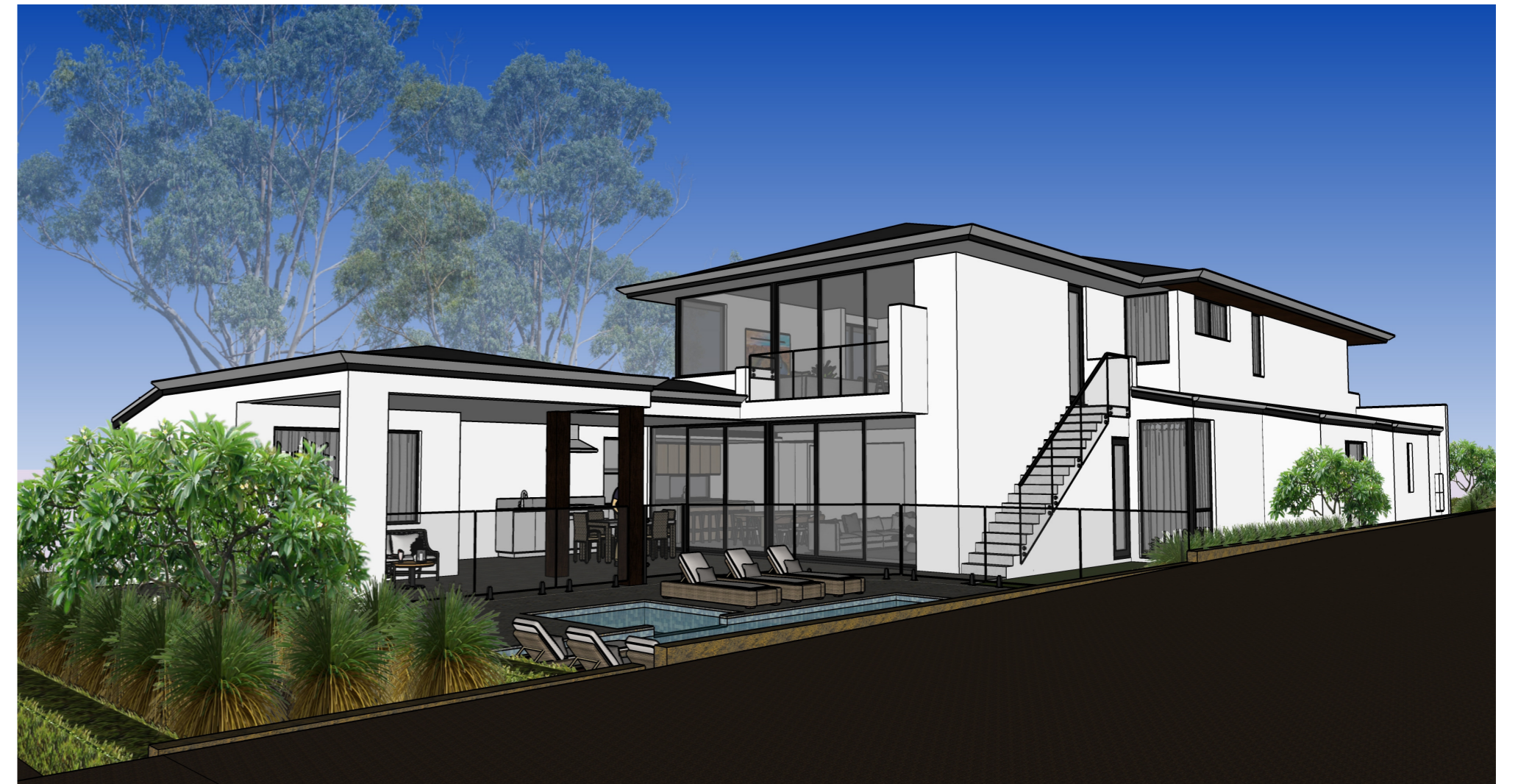
3D Perspective Not to scale