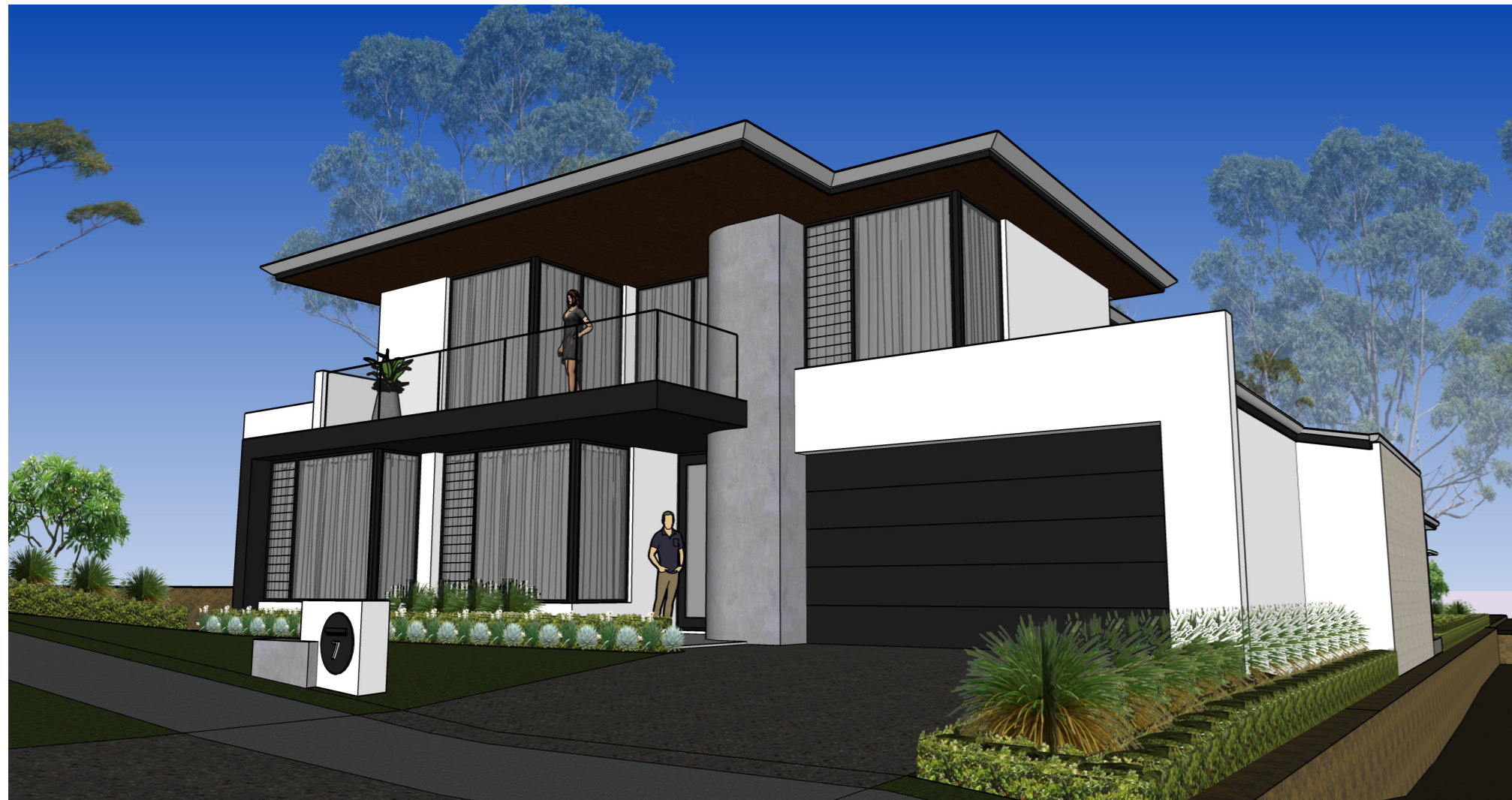
3D Perspective Not to scale